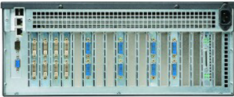
(rear panel of the Fusion Catalyst 4000)